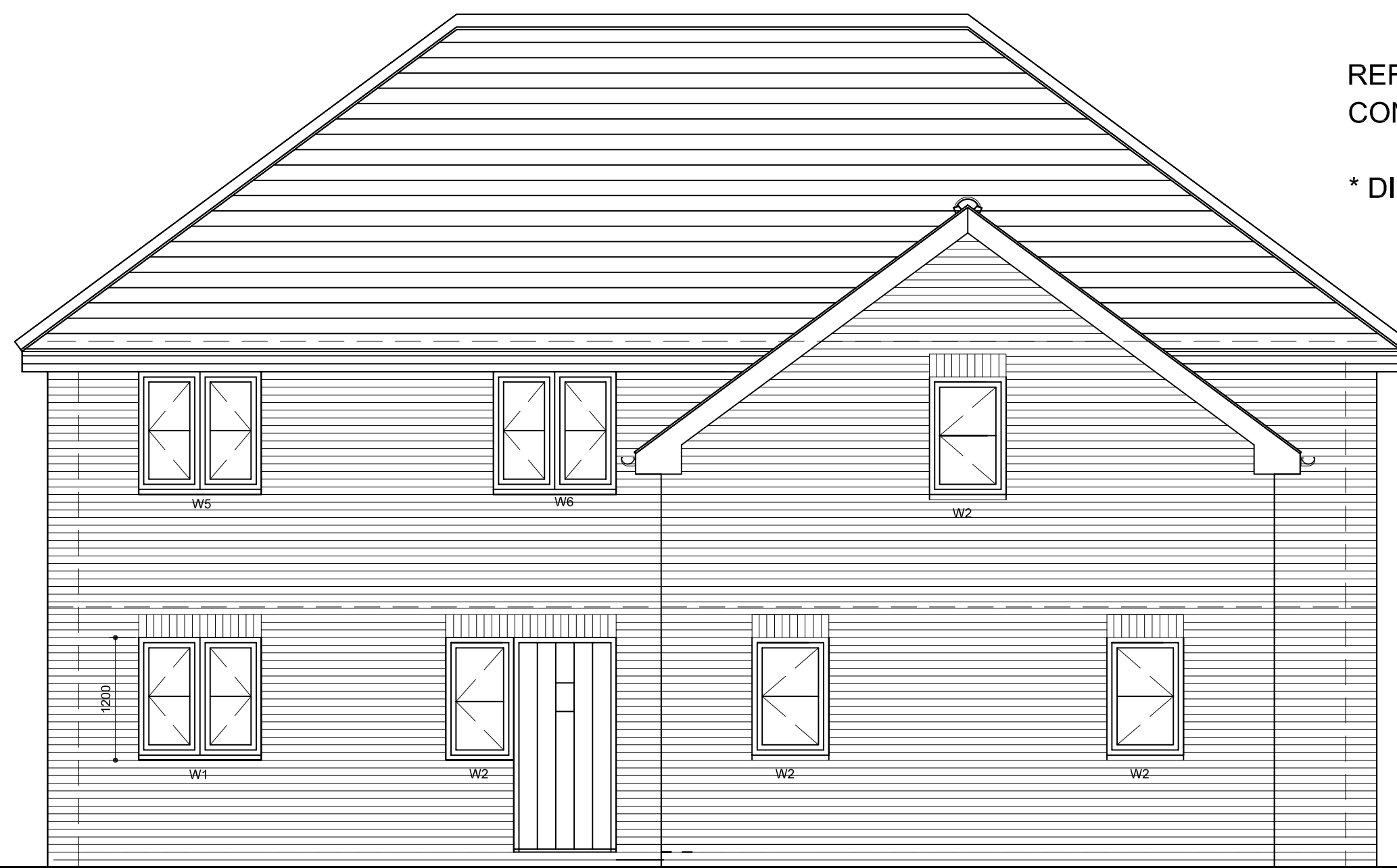
PROPOSED FRONT ELEVATION. 1:50

* DIMENSIONS TO BE CONFIRMED ON SITE WITH CLIENT.