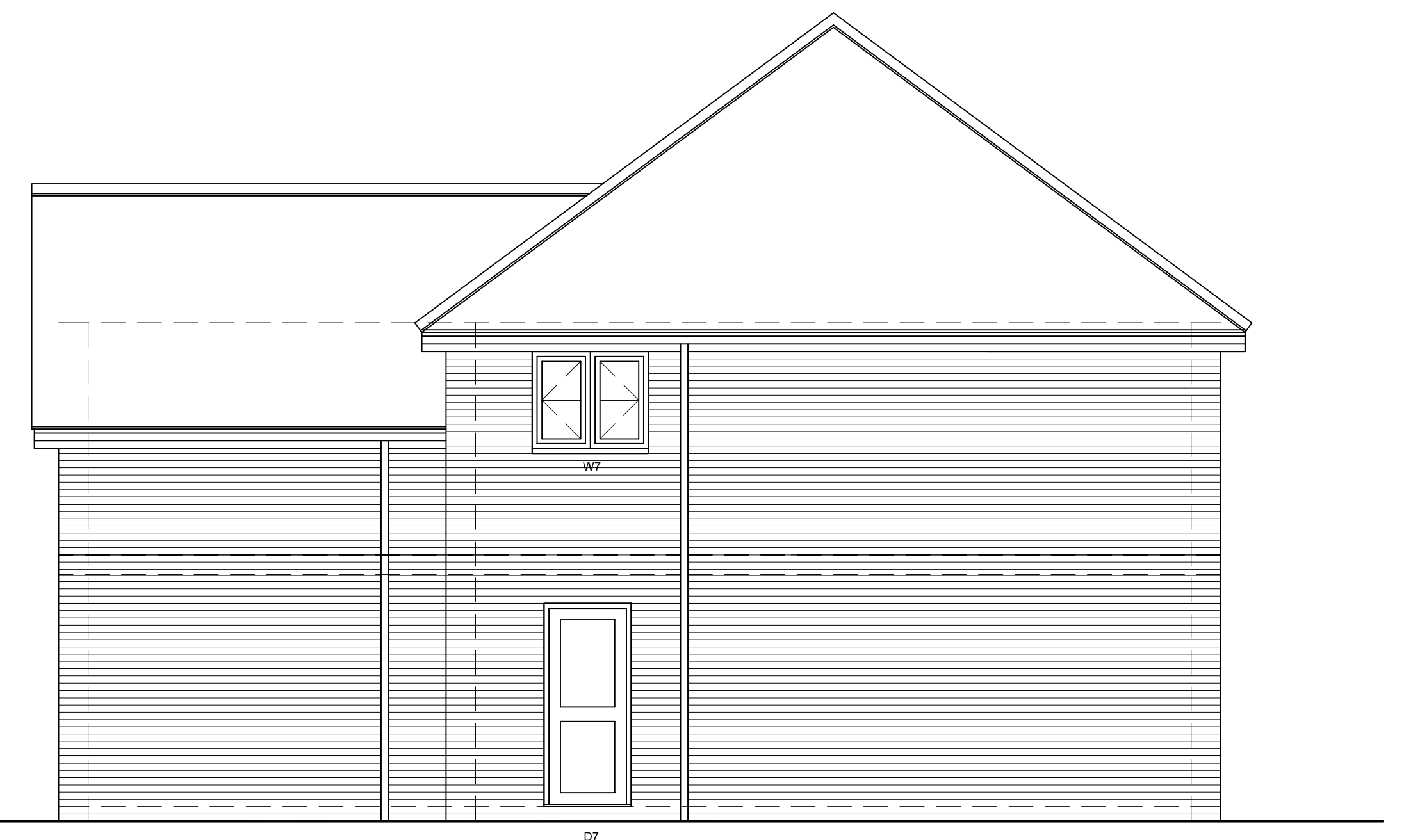
PROPOSED SIDE ELEVATION. 1:50

CLIENT TO RESOLVE PLANNING CONDITIONS AS STATED ON THE PLANNING APPROVAL BEFORE WORK STARTS ON SITE.