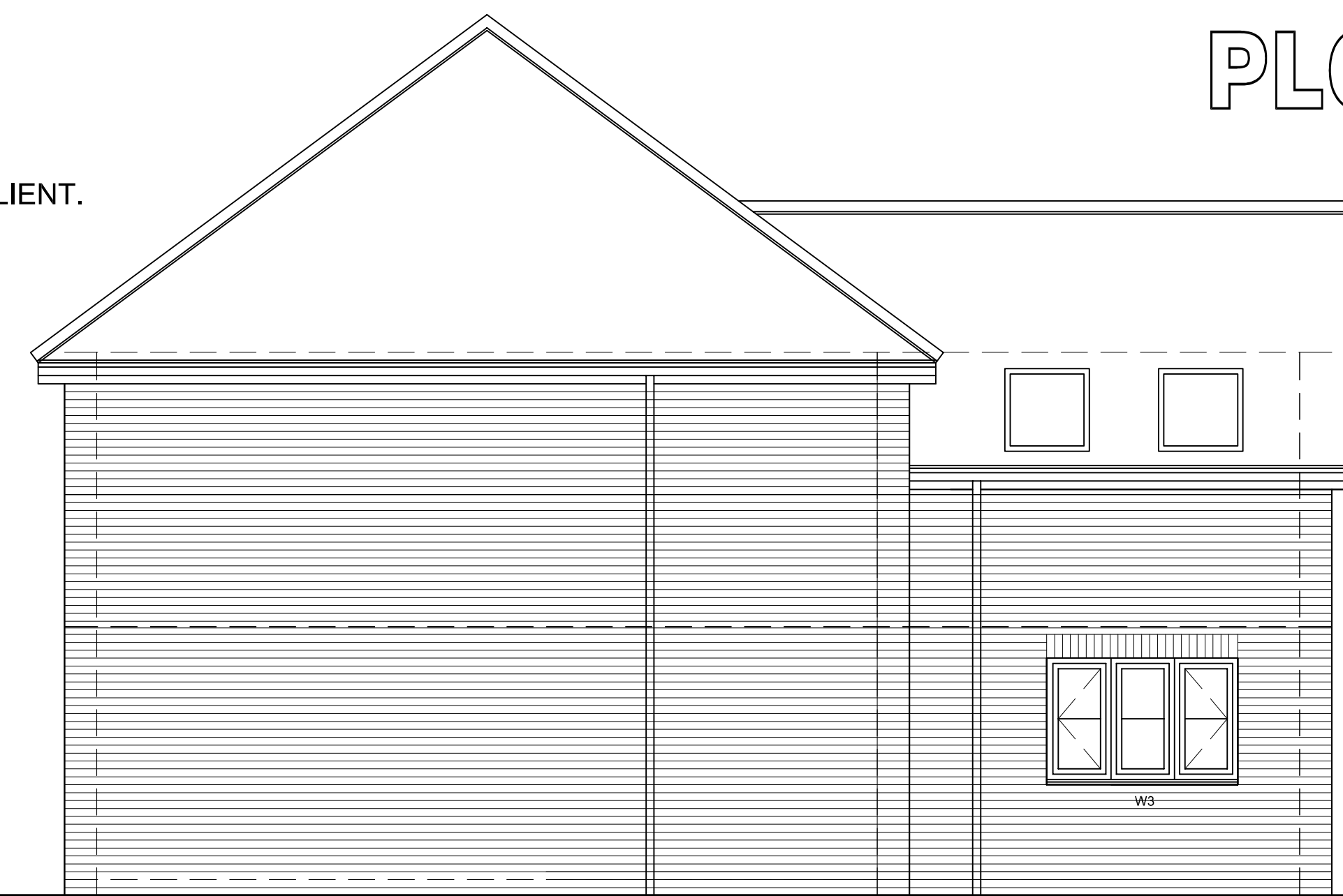
PROPOSED SIDE ELEVATION. 1:50