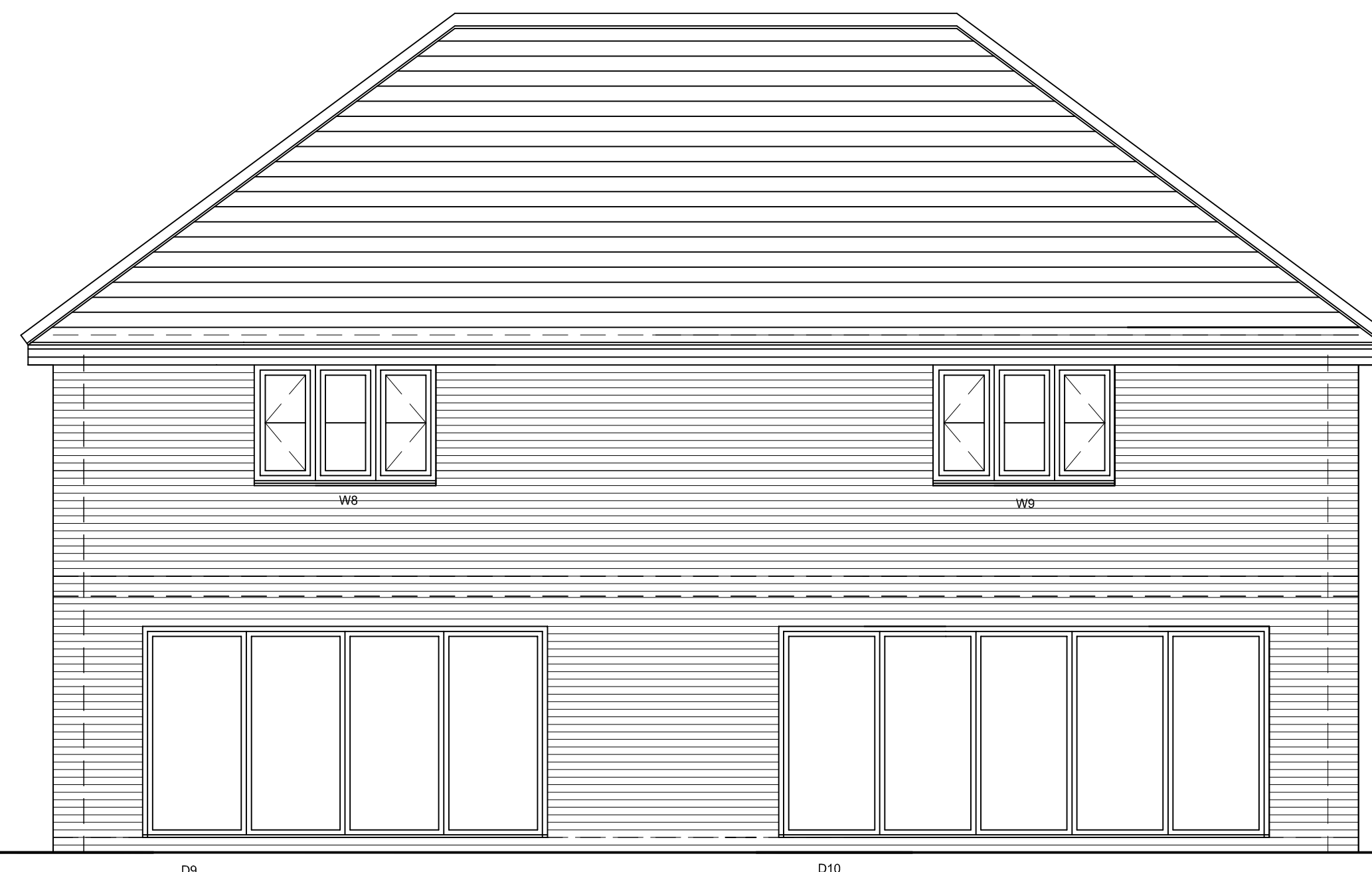
PROPOSED REAR ELEVATION. 1:50